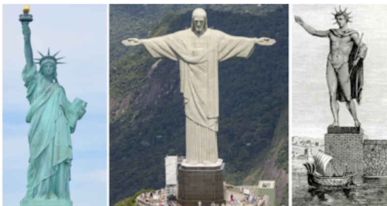
Statue of Liberty 46 metres

(11) The Colossus was an oversized statue, in classical antiquity, 33 metres tall, comparable to the statue of Christ-the-Redeemer above Rio de Janeiro, which is 30 metres tall, eminently suitable as a model for Netanyahu-the-Redeemer.