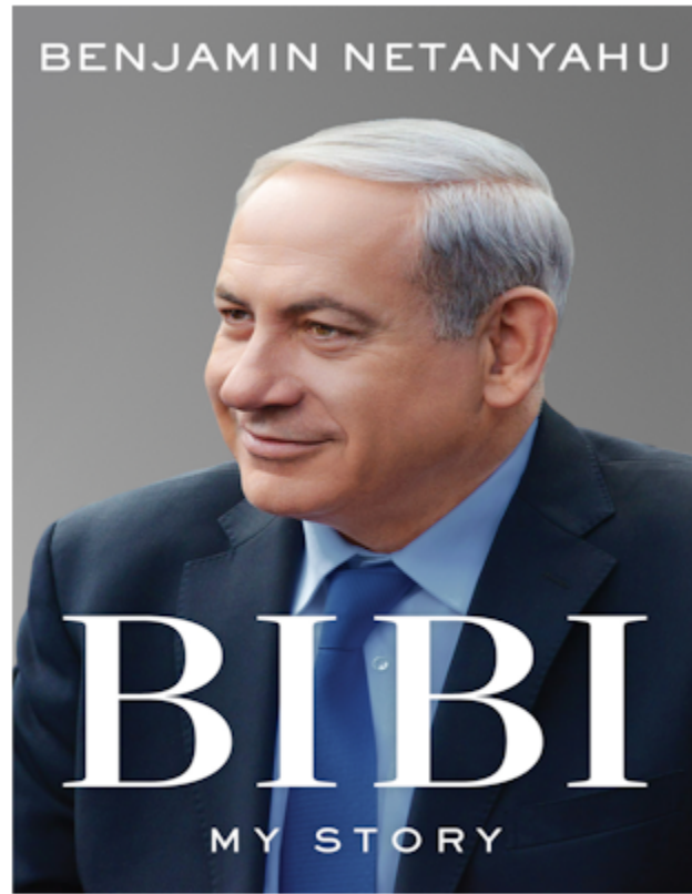
Benjamin Netanyahu MY STORY

(14) "Birds of a feather flock together"